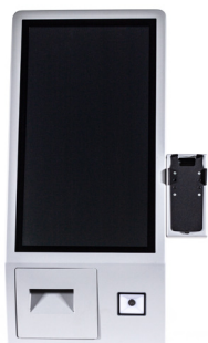
Table Stan 21